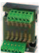
Assembly modules MKS-M, ML 14, MP

An overview of this product range can be found in our online shop